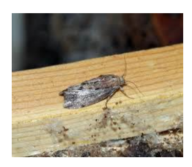
Plate: Adults of G. Mellonella which had been treated at egg stage with different concentrations of two nanoparticles and bacteria spores

Numbers with letters that are significantly different from each other at a probability level of 5%, according to Duncan's multiple range test