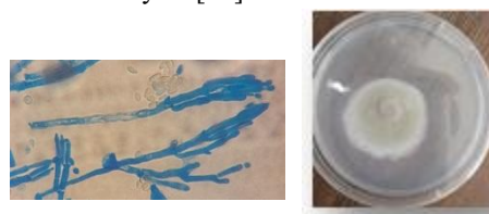
Figure 1. A: Colony of P. digitatum B: Conidiophores of P. digitatum

Isolation and identification results from orange fruits showing symptoms of green mold revealed the presence of the fungus Penicillium digitatum . Colonies were gray green to olive-brown in color, with white mycelium in the early stages, and produced conidia at medium to high densities (Fig. 1a). Colony diameters averaged 3-4 cm after 7 days of incubation at 25°C. The conidiophores were columnar-shaped, thin-walled, and smooth, bearing brush-like structures (penicilli) at their ends, with pointed, cylindrical phials terminating in oval to cylindrical, smooth-walled, white-to-light-green spores arranged in irregular chains (Fig. 1b). These characters are consistent with the taxonomic key of [18]