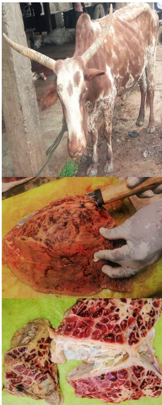
Figure 5. Recently encountered cases of CBPP outbreak in Ilorin, Nigeria: showing an emaciated Cow with typical signs of CBPP on the field with respiratory distress, weakness, grunting with ocular and nasal discharges. Postmortem examination carried out showed a very hard to touch lung tissue, hepatization with thickened interlobular septae.