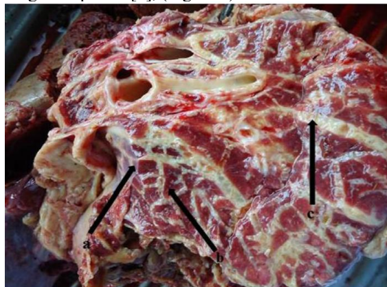
Figure 1. Contagious Bovine Pleuropneumonia (CBPP) showing severe inflammation of the lungs and pleura (a), hepatization (b) and thickened interlobular septae (c) of cattle [2].

Contagious bovine pleuropneumonia (CBPP) is a highly infectious respiratory disease that affects cattle, characterized by severe inflammation of the lungs and pleura [1], (Figure 1).