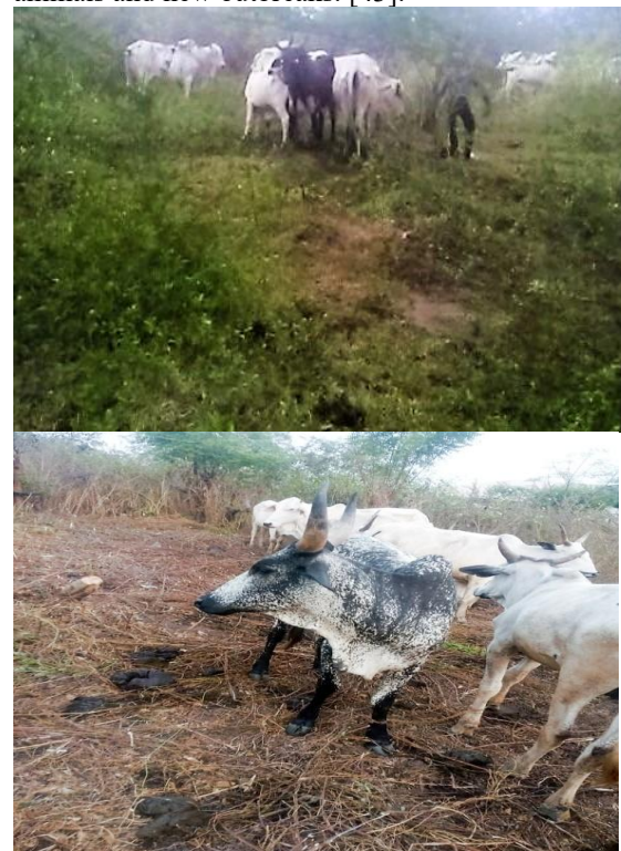
Figure 3. Unrestricted nomadic cattle movement in Ilorin to search for food in the bush instead of the standard practice of intensive husbandry

9. Role of Environmental Factors: Environmental conditions in Africa played a significant role in CBPP's spread [11]. The disease thrives in densely populated cattle areas and close quarters where respiratory droplets can easily transmit from animal to animal [41]. The semi-arid climate in parts of the Sahel and East Africa often necessitates dense gatherings of cattle around scarce water sources, creating ideal conditions for CBPP outbreaks [42]. Seasonal migrations, coupled with regional droughts and resource scarcity, pushed herds into new areas, increasing the likelihood of contact with infected animals and new outbreaks. [43].